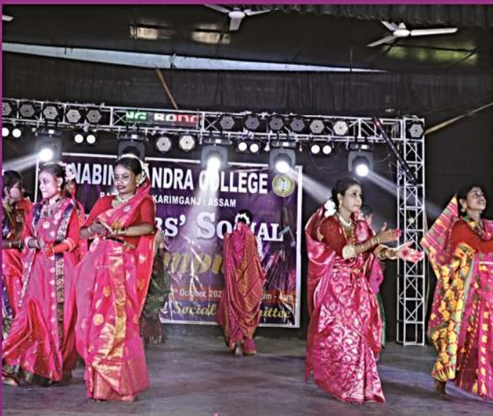
Freshers' Social Ceremony 2023-24