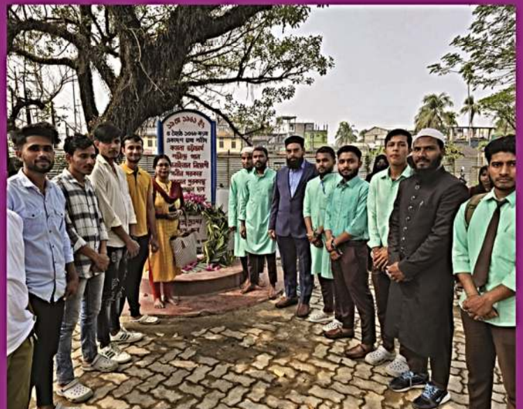
Bhasha Shahid Diwas 19 th May 2023