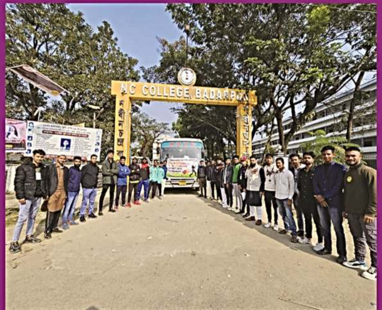
NC. College Team for Assam University Inter College Cricket Tournament 2023-24