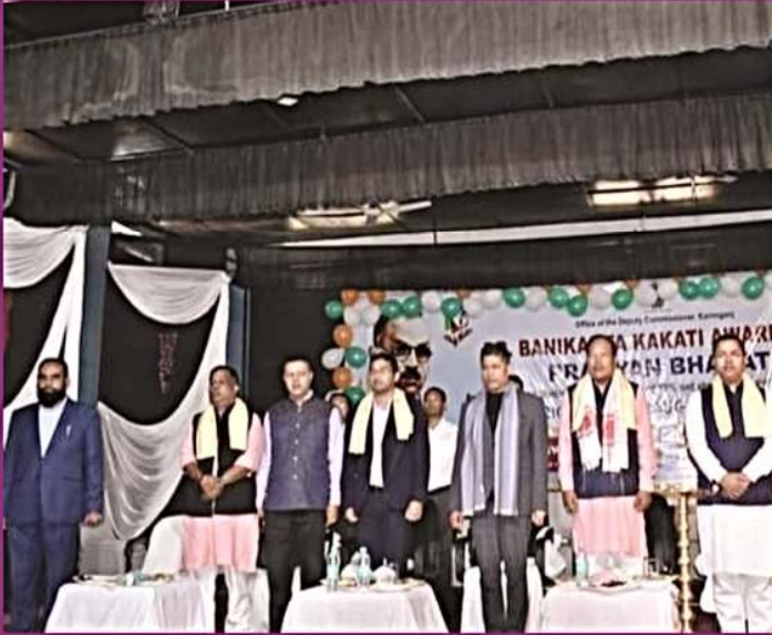
District Level Inaugural Ceremony of Dr. Banikanta Kakati Award at at NC. College