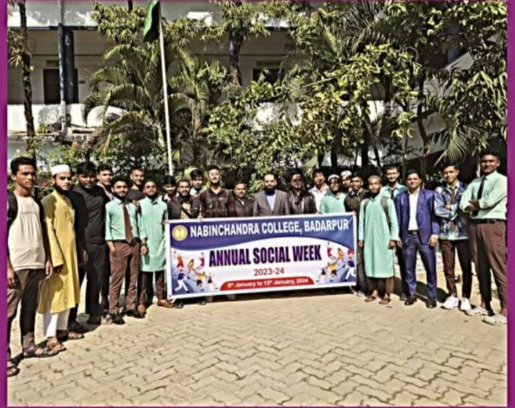
Inauguration of Annual Social Week 2023-24