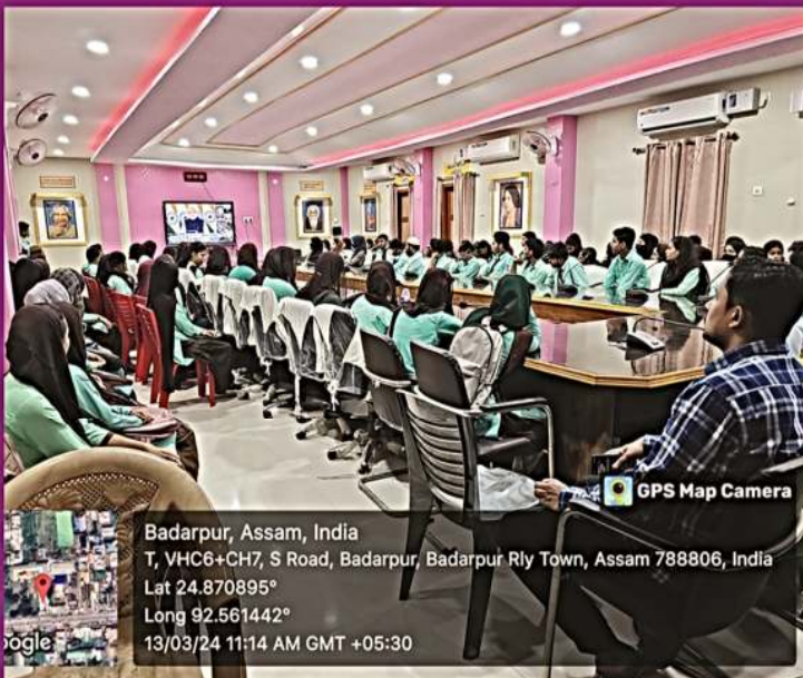
Hon'ble Prime Minister's Foundation Laying Ceremony of Semi Conductor Project at Jagiroad