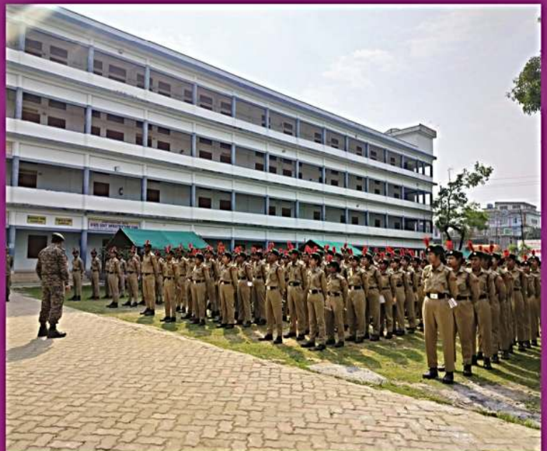
Views of NCC Events during the session 2023-24