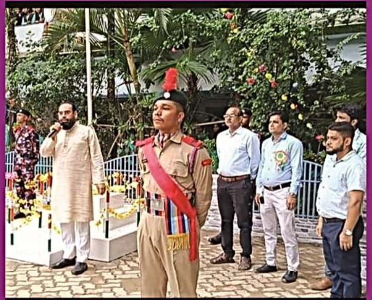
77th Independence Day Celebration on 15th August 2023