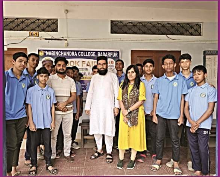
Two Days Book Fare organized by the IQAC