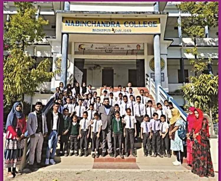
Little Children of Zarer Bazar Model School Visited our College on 27Dec.2023