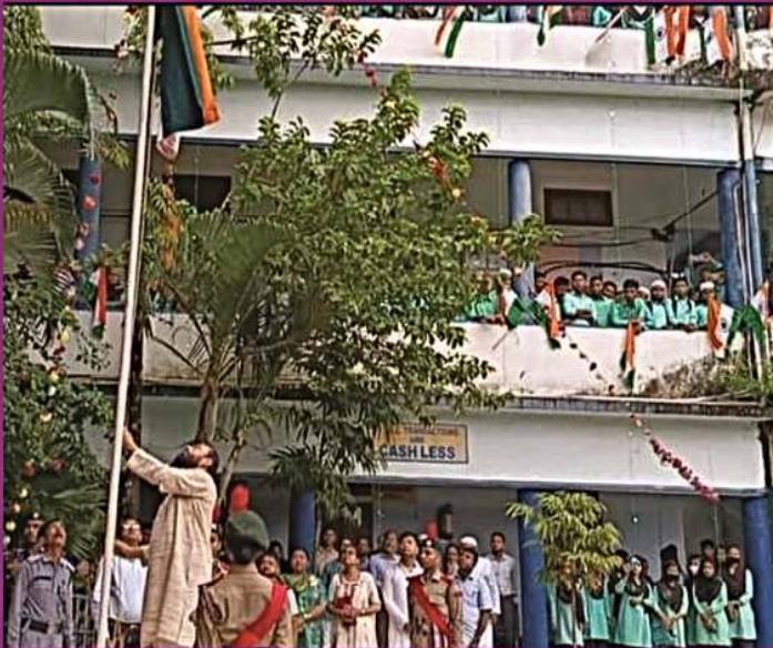
77th Independence Day Celebration on 15th August 2023