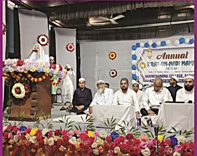
Annual Sirat-Un-Nabi Mahfil 2023-24