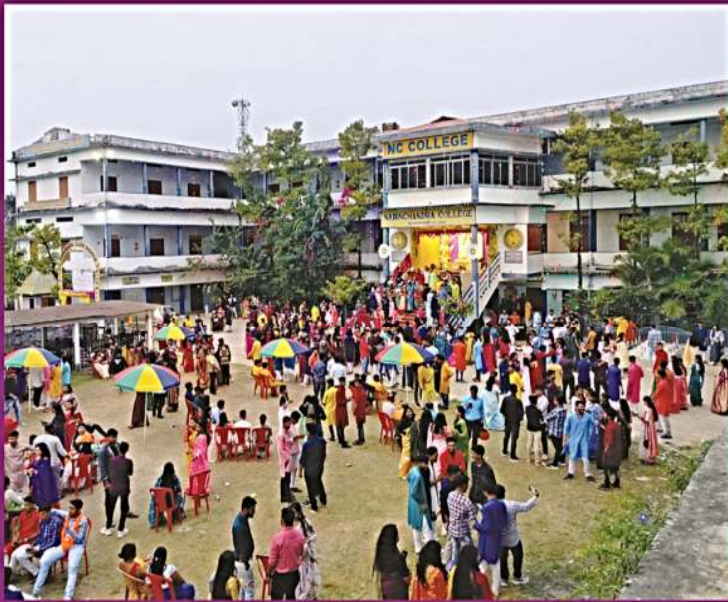
Saraswati Puja 2023-24