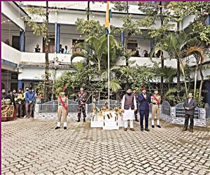
75 th Republic Day Celebration on 26 th January 2024