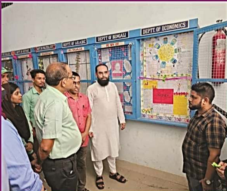
Wall Magazine "Ecozone" inaugurated by the Department of Economics