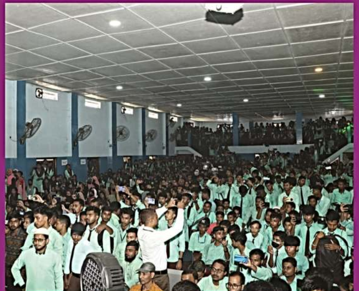
Freshers' Social Ceremony 2023-24