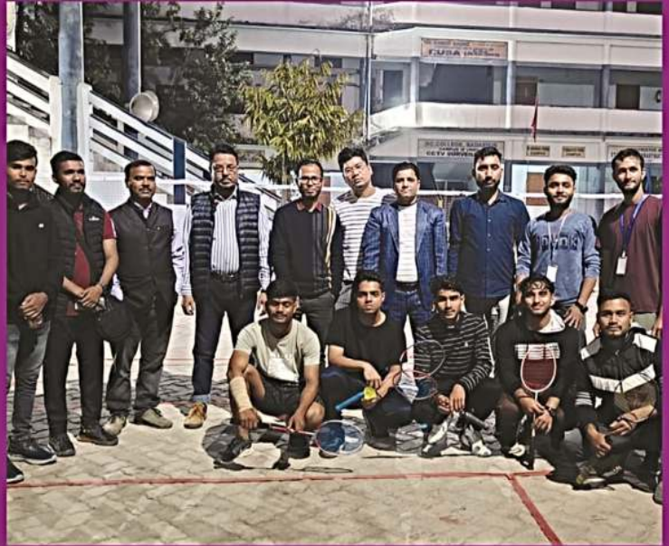
Teams of Volley Ball and Badminton Final Match during Annual Social Week 2024